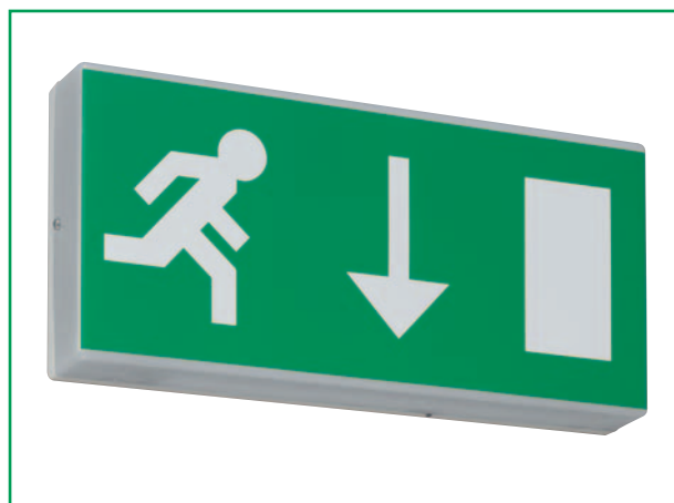
Slimlite with legend