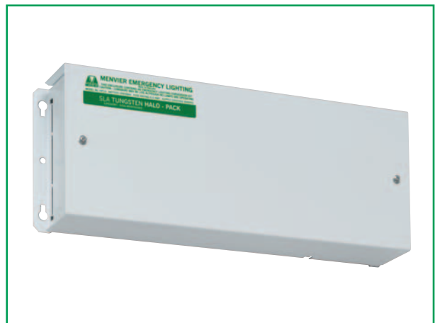
Remote power pack supplied with Halo-Pack