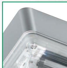
Silver finish skirt