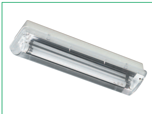
Delta II without optional skirt