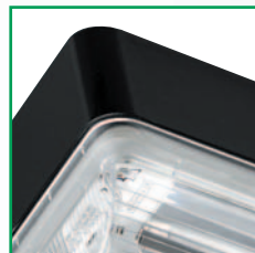
Black finish skirt