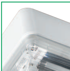
White finish skirt