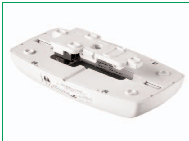
Simple installation via first fix back plate

Self test / slave - To specify state: Low profile, ceiling mounted, Intelligent self testing / Maintained / Non Maintained / Static inverter slave luminaire with dual high output white LED light sources and optical design optimised for axial mounting. Installation via first fix back plate and fully compliant with EN60598-2-22 as Menvier Briteway range part no. _____