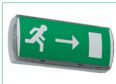
Britelite with legend

Spacing table for example 30m corridor with 2.5m high ceiling Achieving 1 lux minimum on centre line